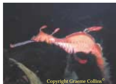
Weedy seadragon ( Phyllopteryx taeniolatus )