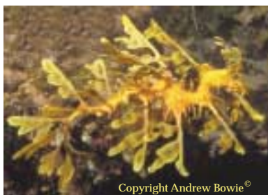
Leafy seadragon ( Phycodurus eques )

The leafy seadragon – a protected species in South Australia – is a stunning example of the unique marine life found in southern Australian waters, and is South Australia’s marine emblem.